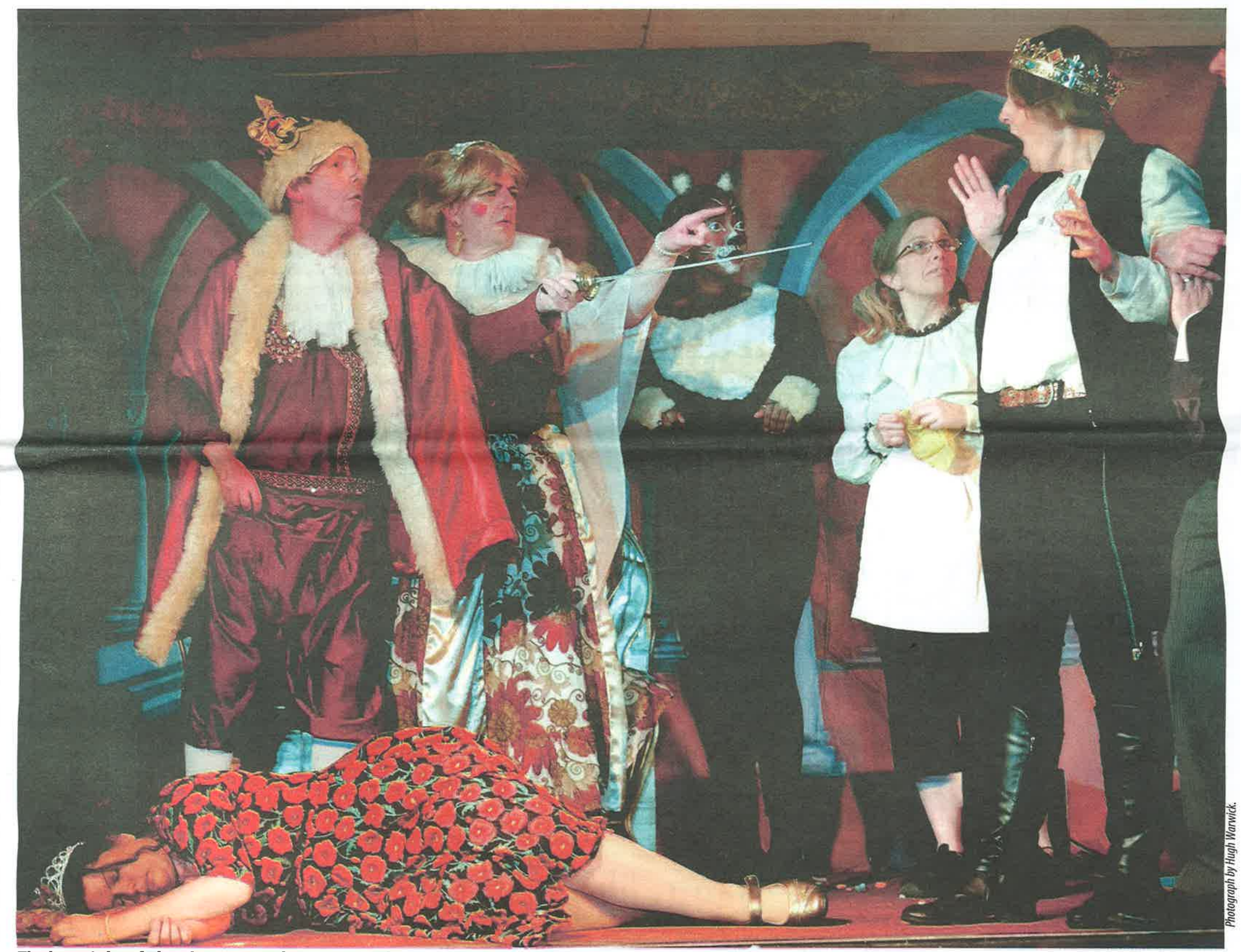
The last night of The Florence Park Panto saw the Community Centre packed with friends and neighbours, all there to enjoy the show. TURN TO PAGE 3

Oxford City Council Consultation: 18 February to 15 April 2016 Private Sector Housing Policy